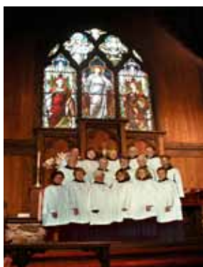
St. Peter's Choir